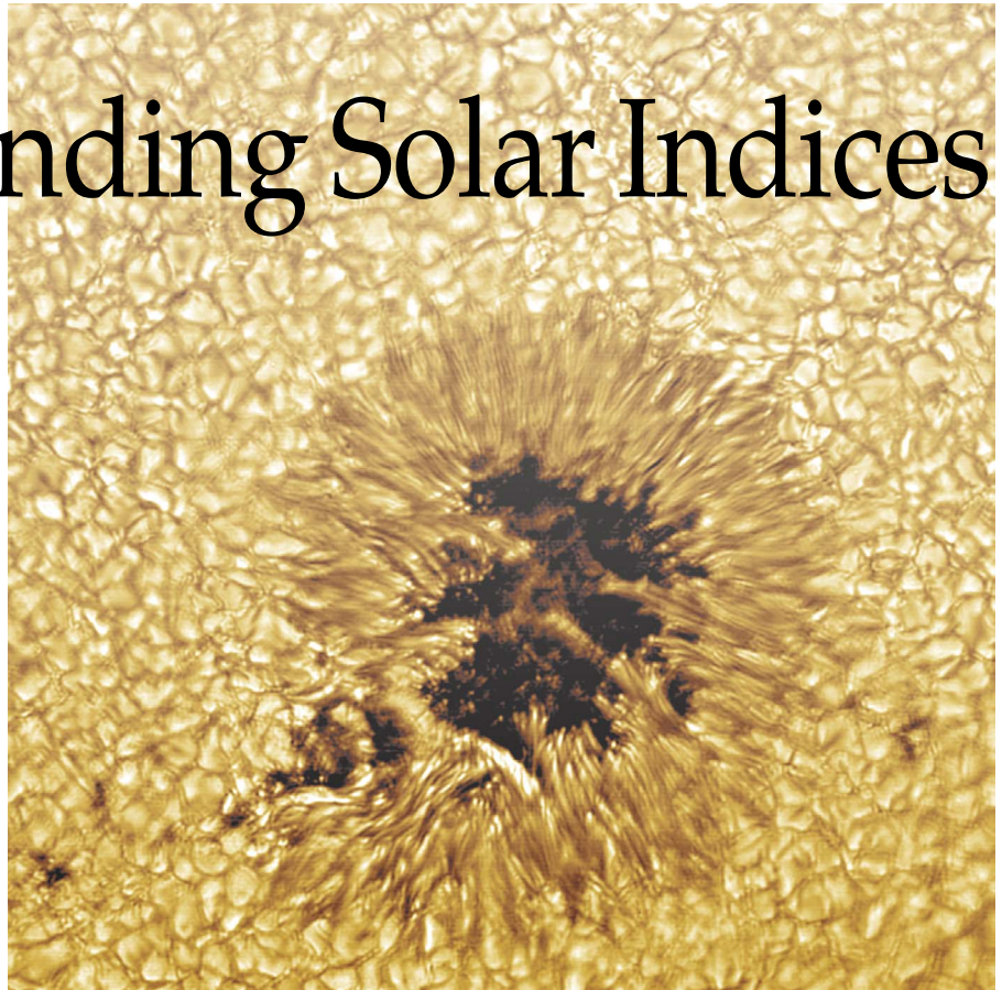
An ultra-close view of a sunspot taken by the NSO Sacramento Peak Vacuum Tower Telescope.

Conditions are continually varying on the HF bands as a result of the varying levels of ionization in the ionosphere. The radiation coming chiefly from the Sun hits the upper ionosphere, causing molecules to ionize, creating positive ions and free electrons. A state of "dynamic equilibrium" exists. The free electrons that affect radio waves recombine with the positive ions to reform molecules. When levels of ionization are higher (when there are more free electrons) the