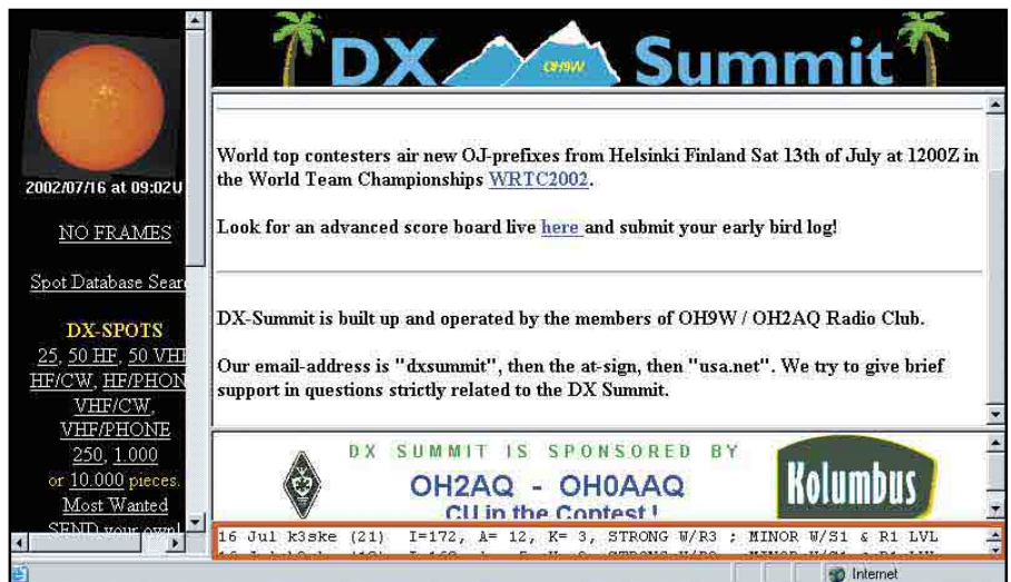
The DX Summit Webcluster at oh2aq.kolumbus.com/dxs/ provides solar activity reports in the frame near the bottom of the window (framed in red).

The first of the two indices used to measure geomagnetic activity is the K index . Each magnetic observatory calibrates its magnetometer so that its K index describes the same level of magnetic disturbance, no matter whether the observatory is located in the auroral regions or at the Earth's equator. At three hourly